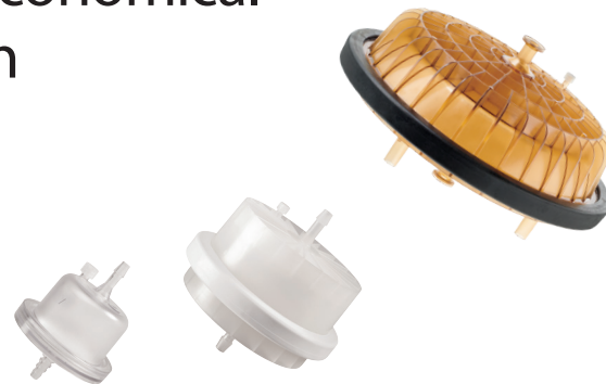
Fig. 2: 2", 5" and 10" capsule

The product range start with a 2" capsule for development work for up to 1 l fermentation broth. Followed by a 5" capsule for up to 10 l and a 10" capsule for up to 25 l. All this are standalone systems (Fig. 2).