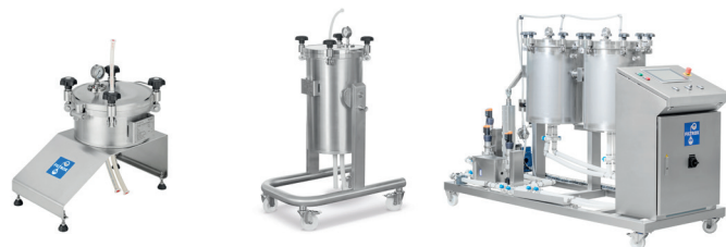
Fig. 4: DISCSTAR 12K, DISCSTAR 12D and fully automated DISCSTAR 16D double housing